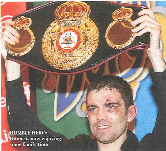
HUMBLE HERO: Dunne is now enjoying some family time

FROM the comfort of his home, and with the WBA super-bantamweight championship facing him, it is still sinking in to Irish hero Bernard Dunne exactly what he has achieved.